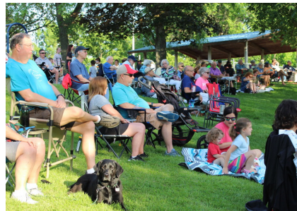
The Pointe at Ballwin Commons