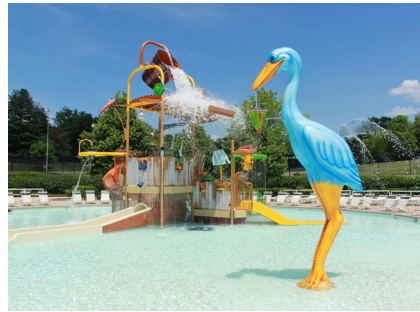
North Pointe Aquatic Center