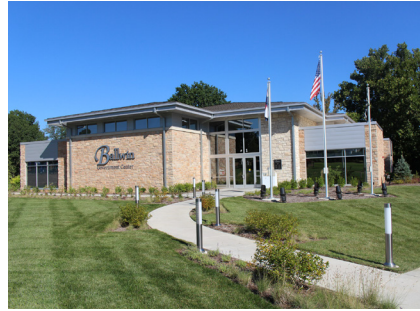
Ballwin Government Center

Area Services Aging Ahead (636) 207-0847 Animal Control (St. Louis County) (314) 726-6655 Better Business Bureau (314) 645-3300 Castlewood State Park (636) 227-4433 County Library (several branches) (314) 994-3300 DMV Drivers Testing Station (636) 256-3951 Earthbound Recycling (636) 938-1188 Employment Office (314) 340-4950 IRS (314) 612-4002 Missouri Highway Patrol (314) 340-4000 Saint Louis Household Hazardous Waste Drop-Off Facility (314) 615-8989 Social Security Administration 1 (800) 772-1213 St. Louis County (314) 615-5000 USPS (636) 227-5783 West County Chamber of Commerce (636) 230-9900 West County License Office (636) 230-5041 Wildlife Rescue Center (636) 394-1880