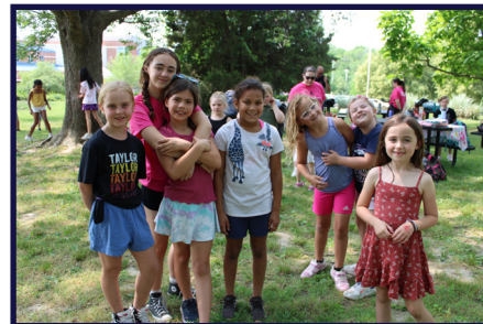
Ballwin Summer Camp

Please note, all meetings are subject to change. Visit our website for the most current information.