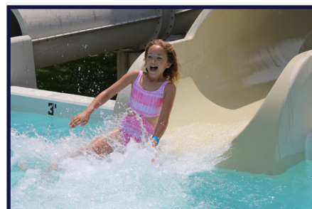
Opening Day of North Pointe, May 27, 2023