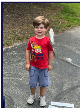
Cops and Bobbers, June 10, 2023